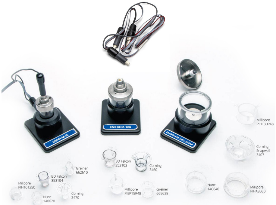
Fig. 1—Endohm-6G, Endohm-12G and Endohm-24G

NOTES and TIPS contain helpful information.