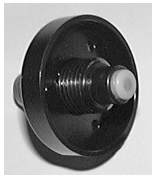
Fig. 6—(Left) A clean EndOhm surface with no spots or irregularities